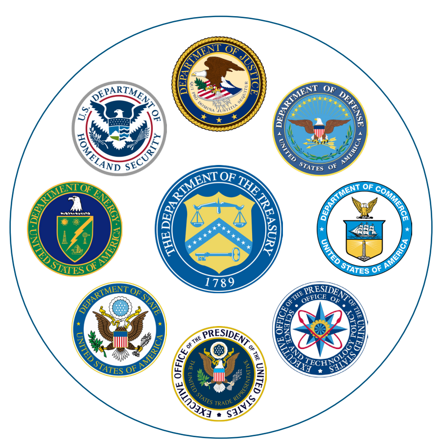
Composition of CFIUS

CFIUS is chaired by the Secretary of the Treasury. The following US government parties also participate in the process: the Departments of Justice, Homeland Security, Commerce, Defense, State, and Energy; the Office of the US Trade Representative; and the Office of Science and Technology Policy. The Director of National Intelligence and the Secretary of Labor are non-voting members of CFIUS. Representatives from other federal agencies, including several White House offices, also observe and, as appropriate, participate in CFIUS's activities.